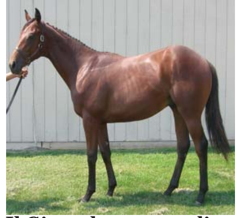
Il Girasole as a yearling