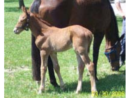
Rio de la Plata as a suckling foal

RIO DE LA PLATA (c. by Rahy out of Express Way (Arg)) - This two-time BTSI graduate, also a homebred, was crowned with the "TDN Rising Star" status after winning his 2nd start at Newmarket by a fantastic five lengths. The colt was sold by BTSI as a weanling for $65,000 and in last year's September sale for $75,000. Rio de la Plata is set to run in the Gr.2 Veuve Clicquot Vintage S. at Goodwood on Aug. 1st. He is owned by Godolphin. Click Here for Rio de la Plata's Chart