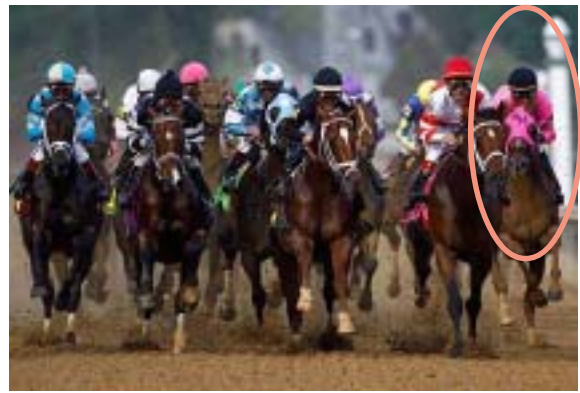
Sedgefield fights for rail position on the 1st turn

At the end of the day, Sedgefield ended up finishing 5th, but only 1 length off of Curlin's place finish.