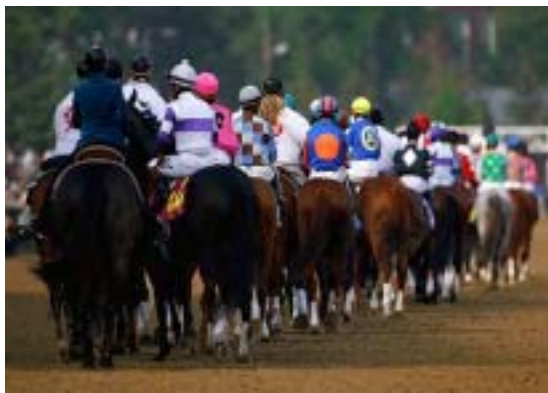
They line up, headed for the gate in the 133rd Kentucky Derby

Click Here for Complete Chart of G1 Kentucky Derby