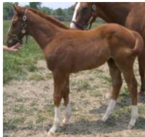
2007 suckling colt out of Iridescence by Tale of the Cat